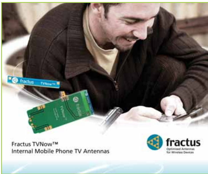
Fractus' TVNow Range of Mobile TV Antennas

As previously noted, when designing a DVB-H/GSM handheld device, the antennas play a central role. Normally, the antenna designer must follow the phone's Industrial Design, which limits the options on where to place the antennas. To complicate matters even further,